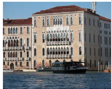
The building is in the heart of Venice, in a suggestive environment

The Faculty of Economics, Ca' Foscari's was the first institution in Italy and the second in Europe which dealt with high schooling in the field of business and economics, taking inspiration from the organisation of the Business School of Antwerp.